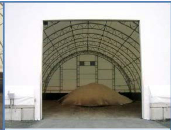
District 14 – Jordan Valley Yard