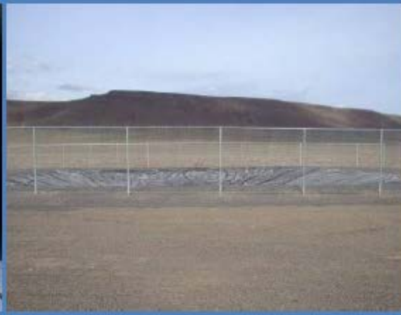
District 14 - Basque Yard