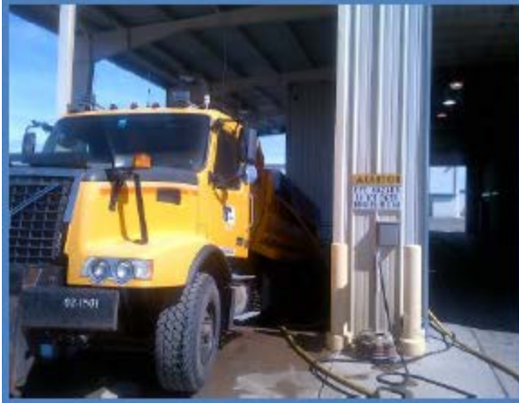
District 8 – Jackson County