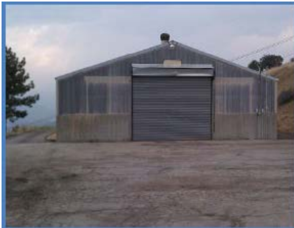
District 8 – CalTrans Hilt Storage