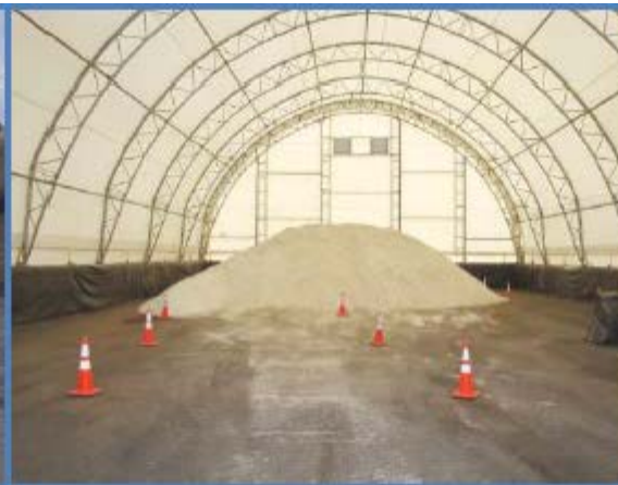
District 14 - Basque Yard