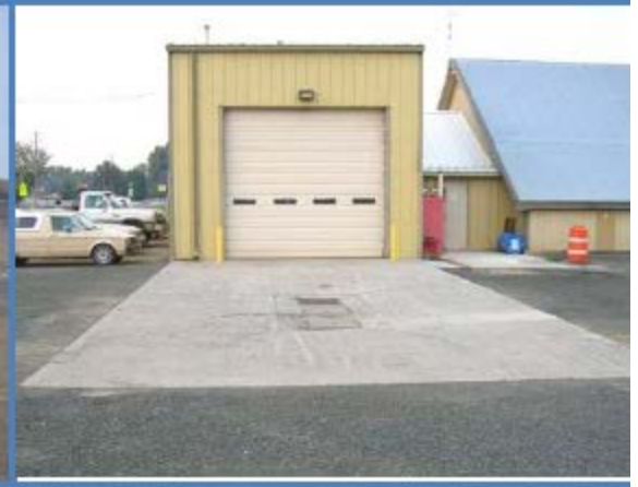
District 14 – Jordan Valley Yard