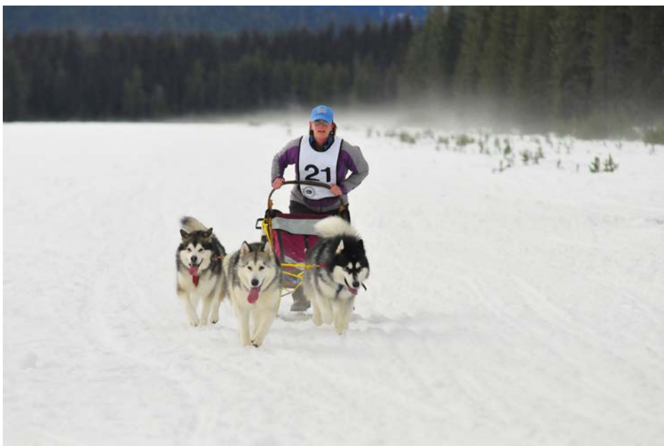
Hallstatt Malamutes, 2015